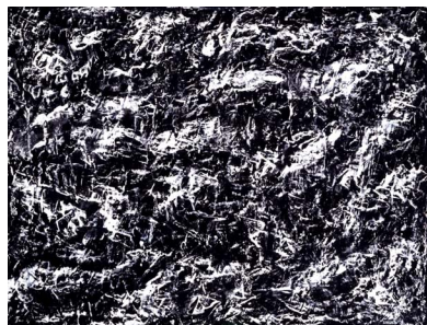
Sal Sirugo C-56 1949