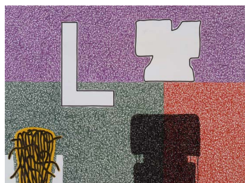
Jonathan Lasker Drawing Blanks 2009